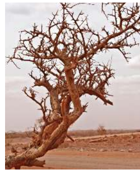
The remains of land ravaged by drought.

The family was assigned to a medical camp that was set up for the severely malnourished. The original plan was for the camp to house 5,000 people. The day Jocynth arrived at the camp, there were more than 20,000 people there. Food, shelter, medical care and water were in short supply.