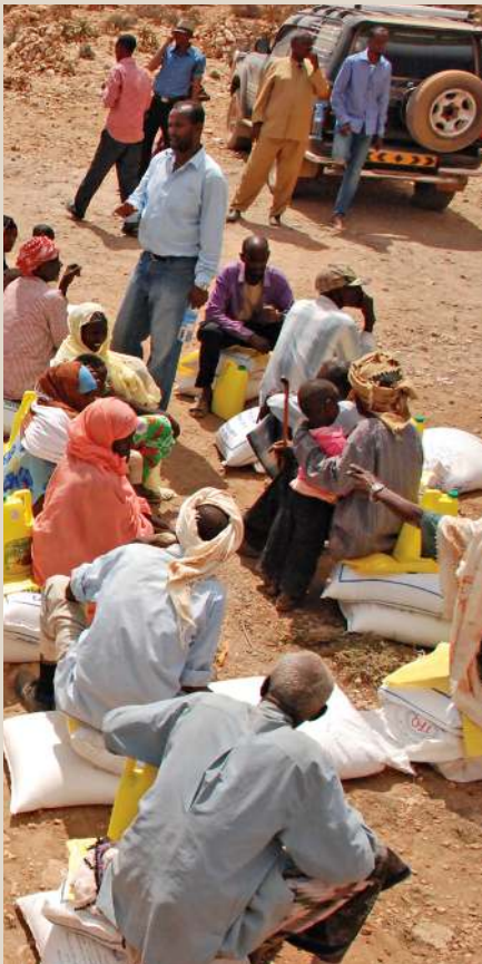
Families with food you provided.

“Every day, more than 21,000 children die— and they don't have to.”