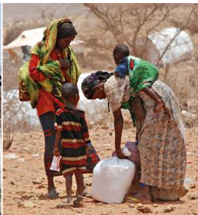
Somali women carry sacks of aid to their tents.