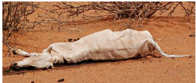
One family's last hope for survival has perished..

They were assigned to a small hut constructed of sticks ( see photo on page 1 ). They had no blankets, plastic sheeting, or pots or pans in which to cook whatever food they could get. They also had no firewood with which to cook the food.