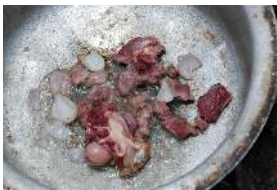
This meager bowl of food is stretched to feed an entire family for a whole day.

On a subsequent trip, we were able to get into Somalia and found several areas where refugees were trying to survive on their own. These people were receiving NO assistance from anyone. While