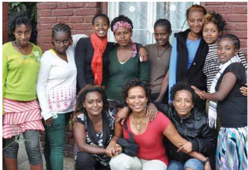
new girls in East African Safe Home