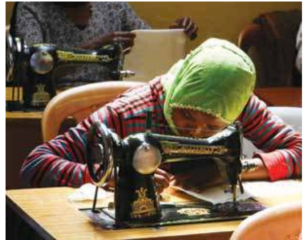
learning to sew