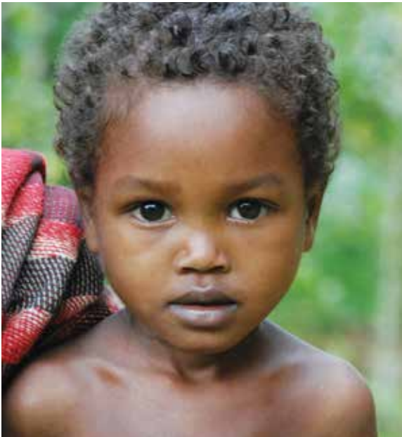
a child you have helped