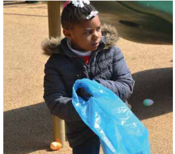
Easter egg hunt 2013