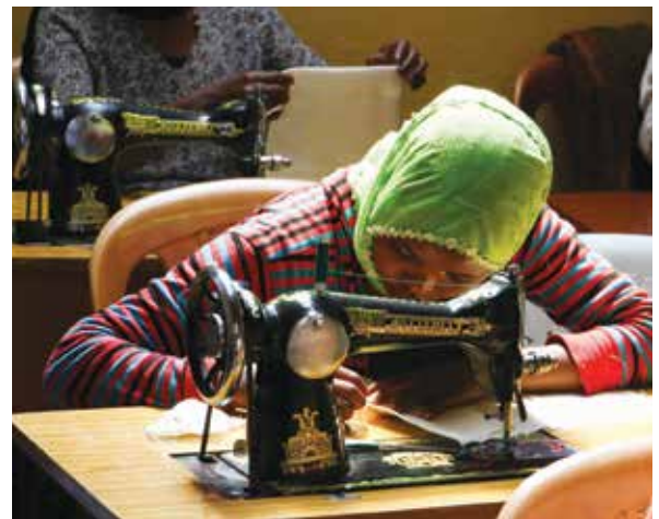
learning to sew