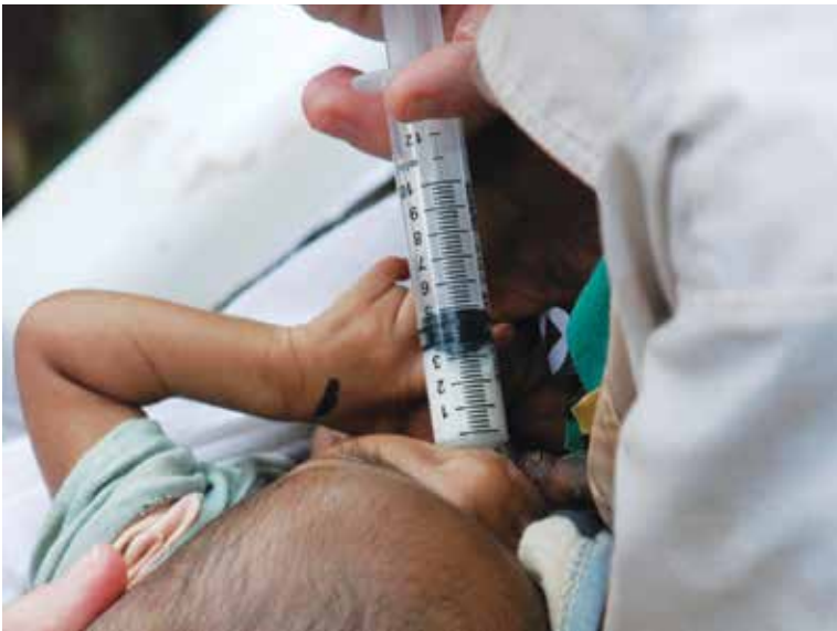
starving infant being fed by syringe