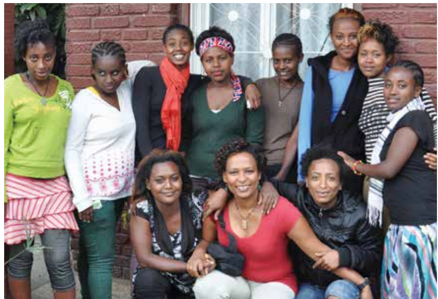
new girls in East African Safe Home