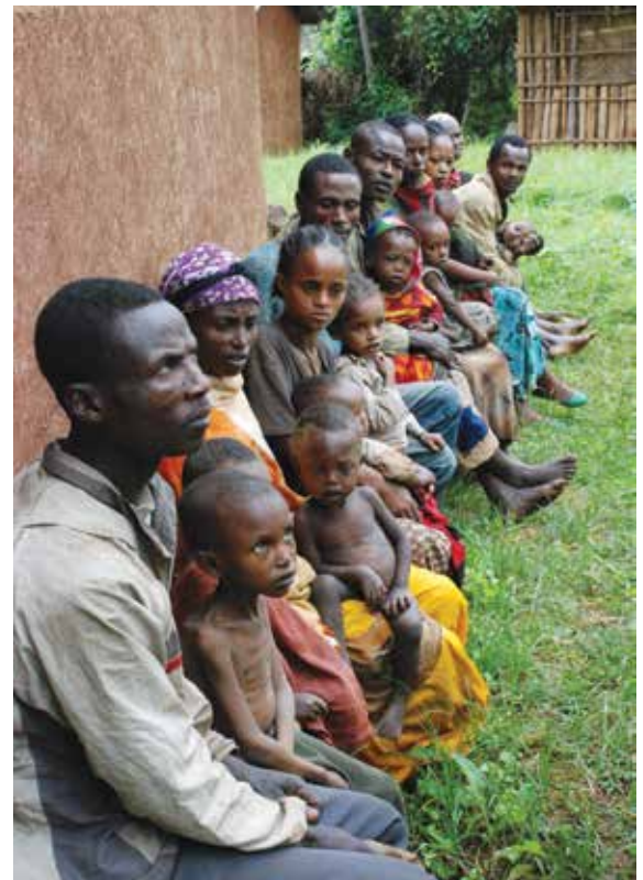
families waiting in line for aid