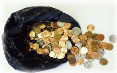
She gave all she had—87 cents—because she was so blessed by YOU.

We received a special offering from a woman who attends Wings regularly. She was so blessed by the love and care she received that when offering time came in one of our services, she gave everything she had. Her offering of 87 cents touched us deeply and reminded us of Mark 12:41 which says: