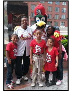
Children helped through Cardinal Care