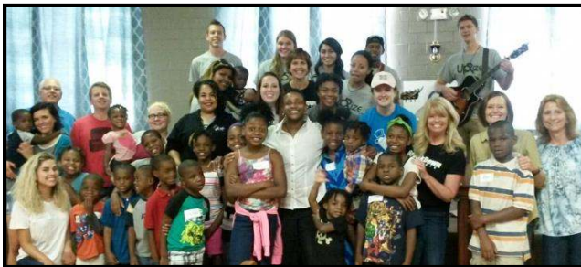
VBS Children having fun with "Breakdown St. Louis"

Thank you for all you do for your community. You are not providing hand-outs, but rather you are making an eternal impact in South St. Louis. To learn more about how you can partner in this ministry, visit www.crisisaid.org/wings or call 314/487-1400.